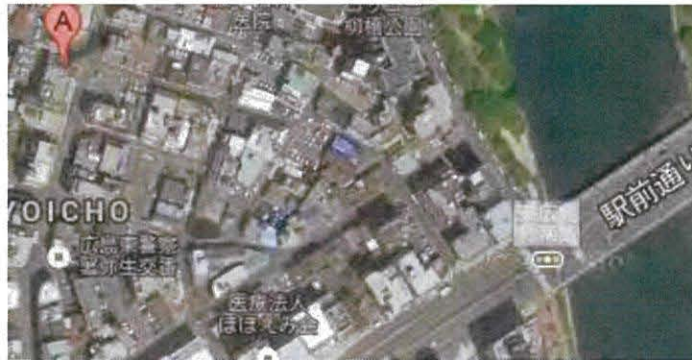
(in vicinity of shown location)

Spice Ecstasy, 4-4 Nagarekawa, Naka-ku, Hiroshima City, Japan