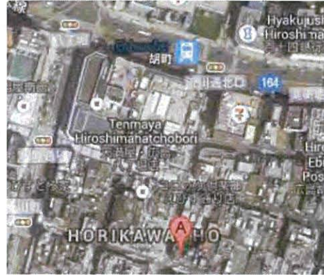
(in vicinity of shown location)

Joint, 3-22 Yayoi i-cho, Naka-ku, Hiroshima City, Japan