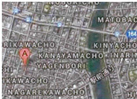
(in vicinity of shown location)