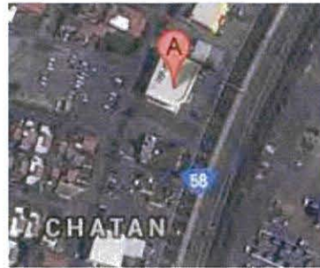
Yoshihara Red Light District. In the Yoshihara Red Light District, establishments with a storefront that faces 329 or 330 are not off-limits.